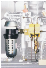
Automatic Condensate Drain(Optional)