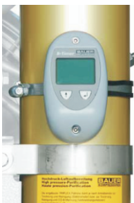
B-TIMER for filter monitoring(Optional)

The driving gear is suitable for short running as well as continuous operation. The 3-/4stage construction and the heavy duty industrial roller bearings guarantee maximum lifetime for all professional applications. The first stage and the high pressure final stage are equipped with high tech polymer piston rings, which proved their outstanding wear and tear properties during several endurance tests in an independent Quality Inspection Center. The maintenance-free rigid oil pump guarantees reliable lubrication.